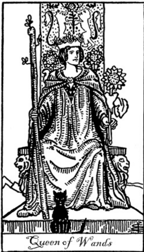
Queen of Wands