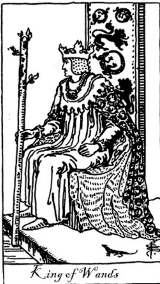
King of Wands